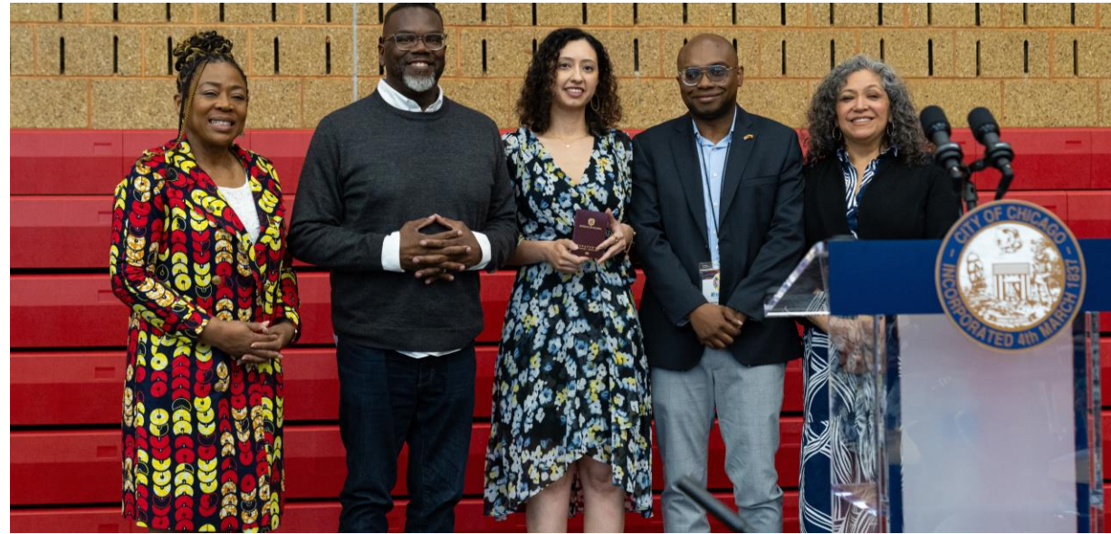
MAYOR BRANDON JOHNSON CELEBRATING AND DANCING WITH GUESTS