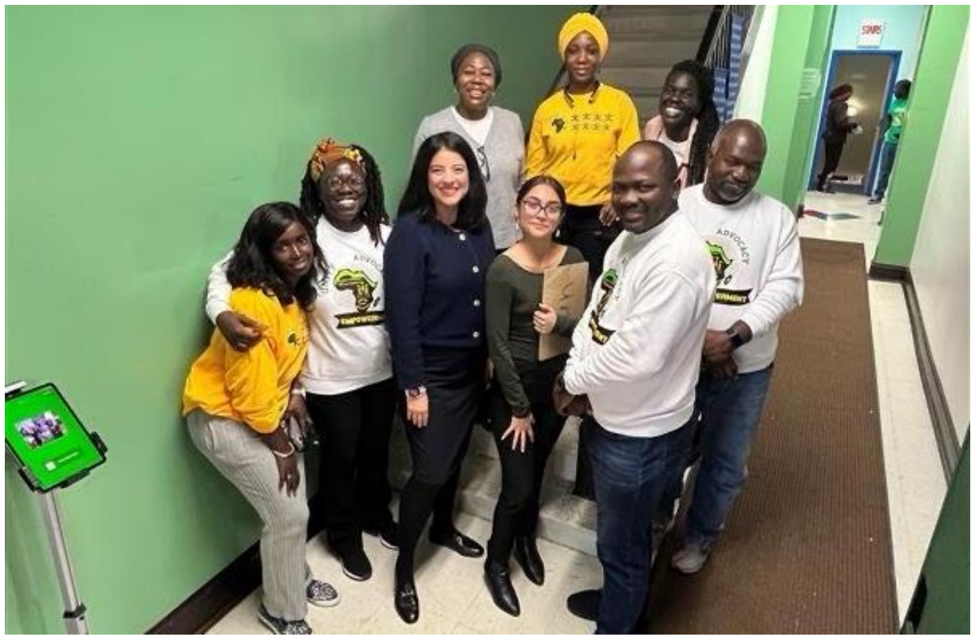
CITY KEY EVENT WITH UNITED AFRICAN ORGANIZATION (UAO)