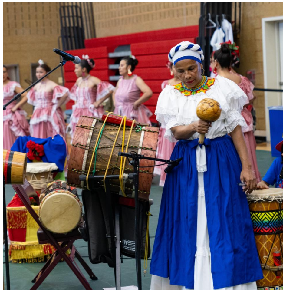
AFRO-COLOMBIAN FOLK SINGER