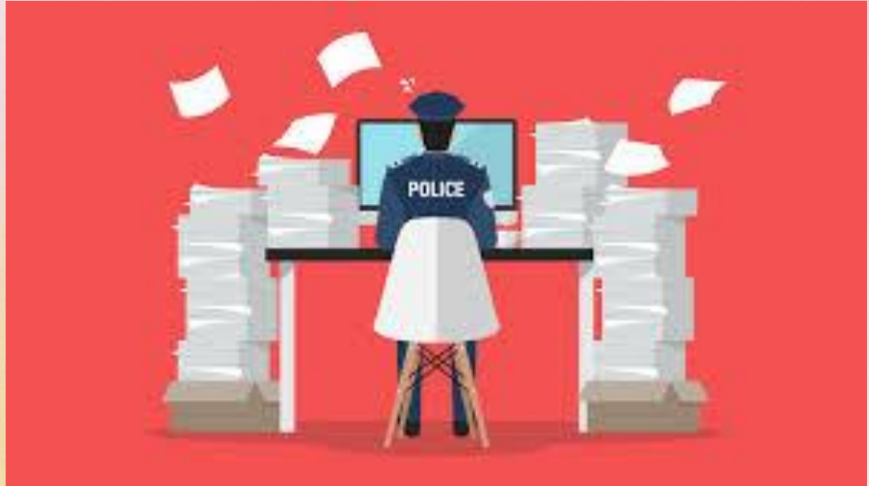
Illustration by Security Management