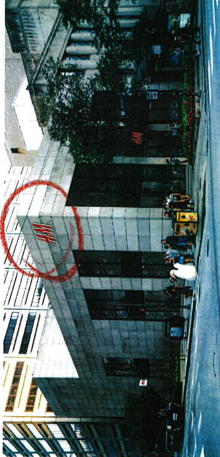
Proposed Storefront Elevation (Corner of N Michigan Ave & E Huron St - Daytime)