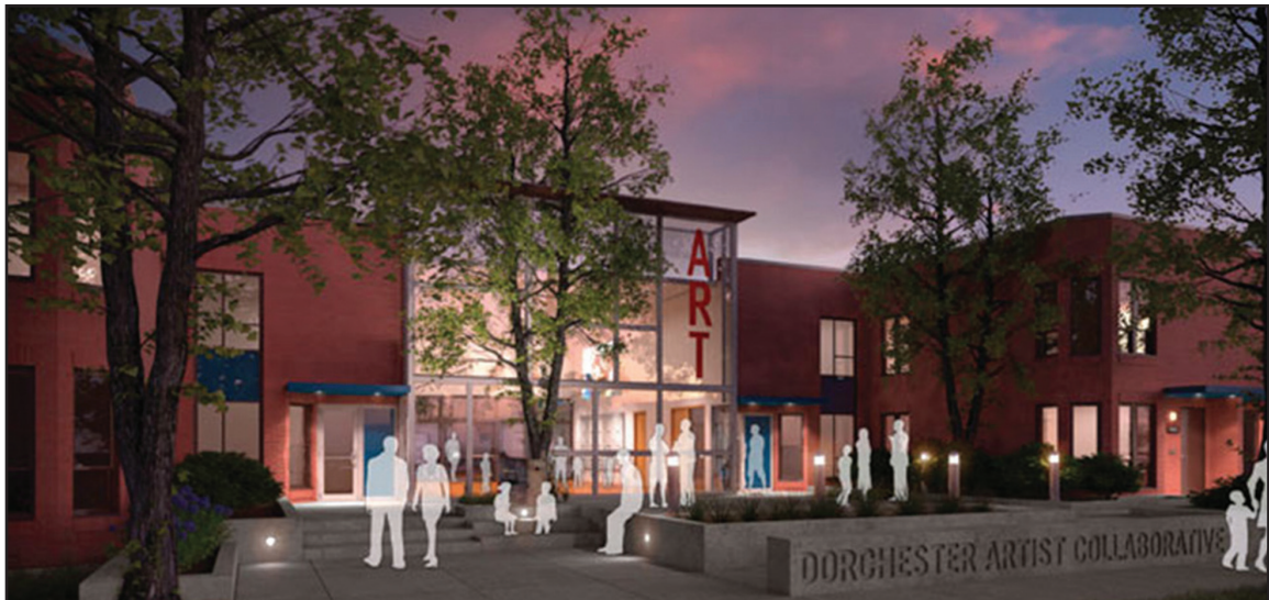
These vacant CHA apartments at 70th Street and Harper Avenue in the 5th Ward are among 32 two- and three-bedroom units slated for redevelopment as artists' residences.

The $11.8 million development, a joint venture of Brinshore Development and the nonprofit Rebuild Foundation, is part of the CHA's Plan for Transformation. The Rebuild Foundation, whose mission includes providing arts programming for children, plans to provide programming in the arts center, coordinating artists living on-site who will be required to volunteer a minimum of five hours per week. This project will also be part of a larger network of artists' residences being established by the Foundation in six midwestern cities.