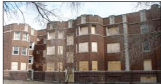
This three-story building at 3550 W. Franklin in the 27th Ward is being rehabbed under the TBI Condo program.

The program began in 2009 with the selection of twelve condo buildings housing a total of 80 vacant units. In 2010, several units were acquired at lower than anticipated costs through donations from banks or by court order as a result of Illinois's newly enacted Distressed Condominium Act. These factors enabled HED to expand the program and add more buildings to the acquisition list. By the end of the ARRA grant period in September 2012, 188 units had been acquired—more than twice as many as originally projected.