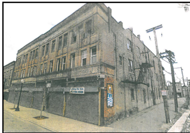
This blighted commercial building at 436 E. 47th Street in the 3rd Ward will soon be reborn as Bronzeville Artist Lofts with the assistance of $4.4 million in NSP2 grant funds.